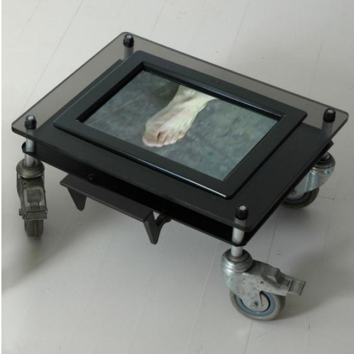
Pas de deux – Perspex, display screen, video, sealed battery, steel castors