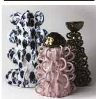
27. Tilly Kubany-Deane Untitled (Milieu Trepidation)

23 x 20 x 20cm 3D printed polymer on acrylic shelf $1,800