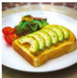
48. Ken + Julia Yonetani Avocado Toast: the reality sandwich

77 x 60 x 80cm Steel, paint, leather string, rivets $1,100