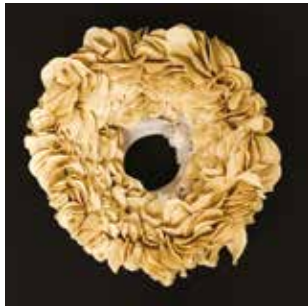
25. Lucinda Kirkby Genet Yellow Porcelain

46 x 50 x 40 Australian Hardwoods $1,350