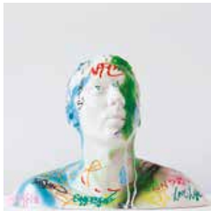
37. Tim Silver Untitled (When Lilacs Last in the Dooryard Bloom'd 02)

34 x 44 x 20cm Porcelain, enamel, acrylic $17,600