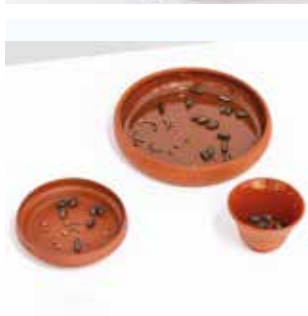
28. Hannah Lees No more than a handful of years I & II

42 x 50 x 32cm Ceramic, glaze $1,200 or $400 each