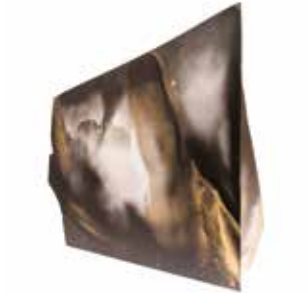
10. Steven Cybulka Umbra (Series #3)

18 x 20 x 20cm Porcelain, silver lustre, metal handle $1,800