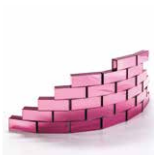
41. Sherna Teperson Ruin (Lust I)

70 x 50 x 30cm Concrete, solar panel, iPad mini with HD video, cable $2,900