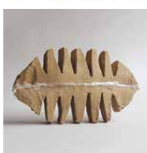
35. Kirsten Perry What's inside?

63 x 61 x 26cm 24 carat gold plated bronze $19,800