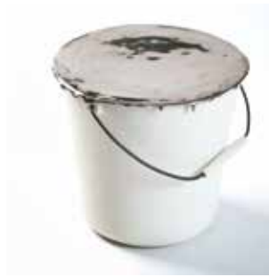
16. Honor Freeman My Silver Lining Runneth Over

71 x 61 x 55cm Found "Migrator" backpack, woollen blankets, aluminium, woollen yarn $1,500