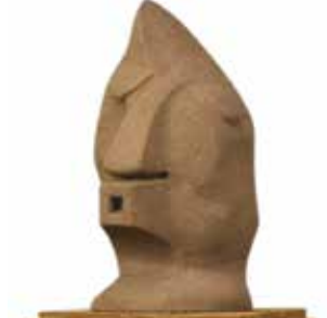
20. Neeraj Gupta Mind's eye

50 x 20 x 20cm Damar Minyak, acrylic, enamel, aerosol $1,700