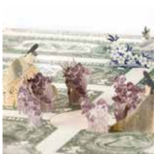
39. Abdullah M. I. Syed Moneyscape – II: Japan and USA

45 x 33 x 26cm Hand cut and assembled Japanese Yen, uncut sheet of US one dollar bills in custom-made Perspex vitrine $9,000