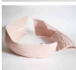
36. Eloise Rankin Rip me apart

13 x 30 x 30cm Porcelain, ceramic pigment, glaze $1,100