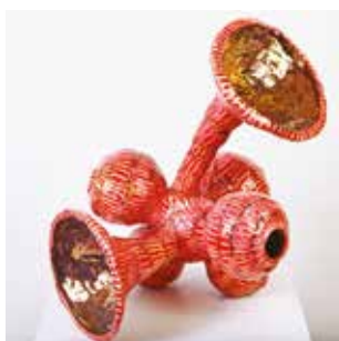
42. Lindy Davy & Tim Barrass Gumnut remix

22.5 x 65 x 15cm Wooden blocks, mirror Perspex, PVA, adhesive $1,600