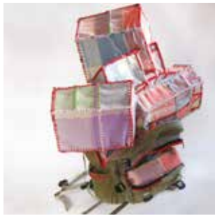
9. Alison Clouston Migrator

71 x 61 x 55cm Found "Migrator" backpack, woollen blankets, aluminium, woollen yarn $1,500