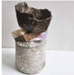
17. Rebecca Gallo All you could hold

66 x 60 x 21cm Acrylic, epoxy resin, spray paint $1,100