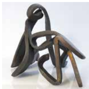
46. Fiona Watson Venus of Urbano

25 x 60 x 40cm Ceramic, plaster, oil paint, wood $8,500