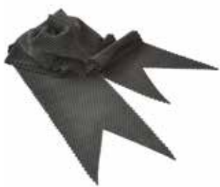
12. Paula Dunlop Ribbon (matte black)

78 x 72 x 65cm Wassily Chair frame, 6000 nickel steel beads, 300 24-carat gold plated skulls $10,000