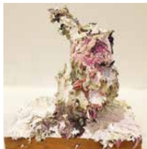
45. Craig Waddell There's A Monster Disco At Night Time In My Studio

35.5 x 60 x 40cm Neon, acrylic paint, plywood $8,800