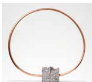
22. Anna Horne Metal on Metal

50 x 50 x 8cm Copper pipe, cast aluminium $880