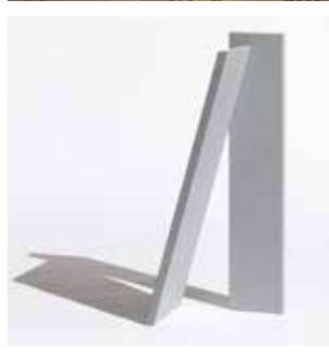
31. Rocket Mattler Hale

50 x 50 x 60cm variable Forged steel $3,000