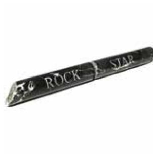
21. Lee Harrop Rock Star #1

70 x 55 x 33cm Reclaimed cardboard and wood, gesso, acrylic paint $600