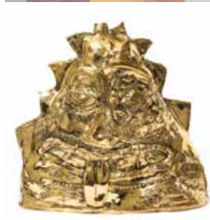
34. Ramesh Mario Nithiyendran Pointy Gold Head

80 cm x 80 cm x 53 cm Acrylic, acrylic mirror $7,000