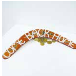
19. Amala Groom Copywrong

35 x 20 x 5cm Fake boomerang, ochre, acrylic, Australian currency $1,770