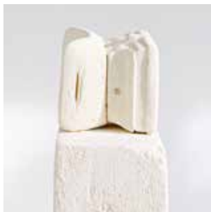
38. Katie Stackhouse Perspicacity Headset I

34 x 44 x 20cm Porcelain, enamel, acrylic $17,600