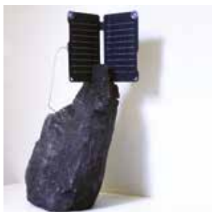
40. Julian Talarico Harbour Archaeology (petrification structure for a carpark)

45 x 33 x 26cm Hand cut and assembled Japanese Yen, uncut sheet of US one dollar bills in custom-made Perspex vitrine $9,000