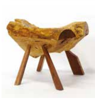
24. Robbie Karmel Truth Coming Out Of An Open Cut Mine To Shame Mankind

46 x 50 x 40 Australian Hardwoods $1,350