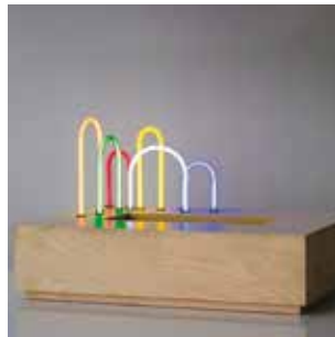
44. Brendan Van Hek The continual condition: positions taken

26 x 80 x 62cm Porcelain, oxides, stains $6,500