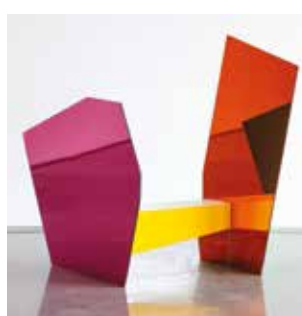
33. John Nicholson Whale Vision

80 x 14 x 10cm Patinated bronze, unique state $12,500