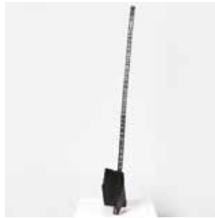
32. Anne-Marie May Residue (model #3)

80 x 14 x 10cm Patinated bronze, unique state $12,500