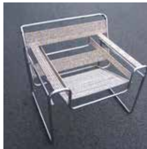
18. Mathieu Gallois God is in the detail

7 pieces, 17 x 12 x 12cm Found timbers from council collections $1,800