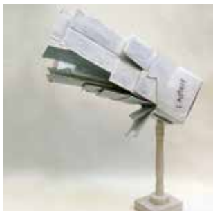
14. Shane Forrest Speak up

65 x 45 x 45cm Pigment in white cement $12,000