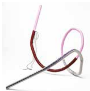
47. Min Wong Rabbit Pose, Sansangasana

77 x 60 x 80cm Steel, paint, leather string, rivets $1,100