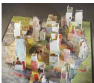
43. John Tuckwell Towers and monuments

60 x 60 x 50cm Fired clay, glaze, Mozzibyte sound $3,500