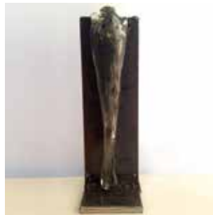
14. Stevie Fieldsend As we melted into each other... 47 x 15 x 28cm Glass, metal filings, steel plate Courtesy Arterreal $3,000