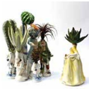
9. Mariana del Castillo The Feral Suitors 33 x 50 x 25cm Recycled porcelain figurines, plastic $3,500