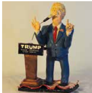
19. Michael Harrell The Donald 40 x 20 x 14cm Fired clay, aluminium wire, gold leaf $3,500