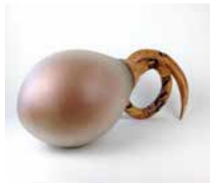
20. Tevita Havea Tuna 22 x 48 x 21cm Glass, sand, tapa cloth, wood, resin $4,800