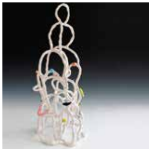
10. Lynda Draper Apparition 80 x 43 x 50cm Ceramic and various glazes Courtesy Gallery Smith $3,950