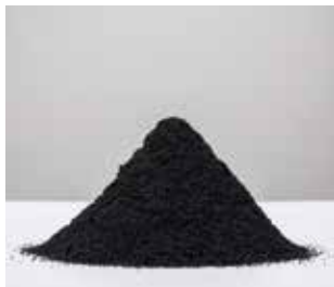
13. Emma Fielden An Infinite Line (1km) 60 x 60 x 10cm with panel. Linen thread, polyurethane coated aluminium panel Courtesy Dominik Mersch Gallery $9,000