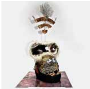
7. Selena de Carvalho searching for a connection [planned obsolescence] 70 x 25 x 28cm Coral, polystyrene, gold leaf, apple advertising, diamontes, dog's teeth, motorbike helmet, black glitter, wire, woven pandanus $1,500