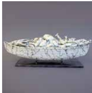
18. David Hamilton Fishes and Loaves – Set in Stone 18 x 53 x 22cm Hydrographic print on cast aluminium $4,800