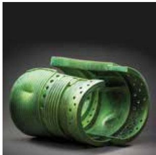
12. Merran Esson Fragment 53 x 38 x 47cm Fired clay Courtesy Stella Downer Fine Art $3,000