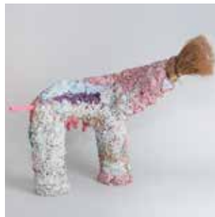
17. Lizzie Hall Self portrait with broken hula hoop 70 x 60 x 45cm Weetbix, acrylic, pigment, polypipe, concrete, whitewashing brush, varnish, hula hoop $1,300