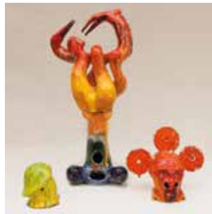
15. Trevor Fry One bottom three tops Variable Glazed ceramic $4,500