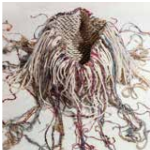
8. Tracey Deep kelp 80 x 65 x 80cm Bamboo rope, raw recycled silk fibre, wire $7,800