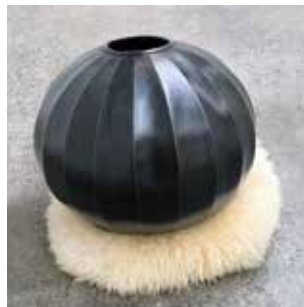
16. Natalie Guy Glowed 40 x 42 x 42cm Bronze, nylon, foam $7,500